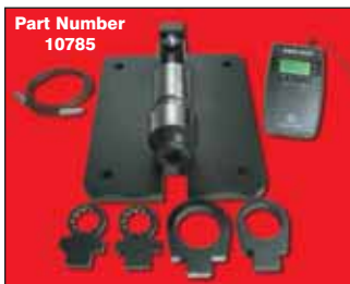
Part Number 10785 RCA-1000 Torque Range 100-1000ft/lb Accuracy +/- .25%