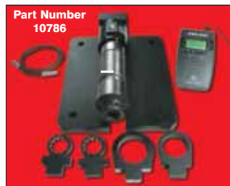
Part Number 10786 RCA-3000 Torque Range 300-3000ft/lb Accuracy +/- .25%