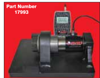
Part Number 17993 RCA-6000 Torque Range 600-6000ft/lb Accuracy +/- .25%