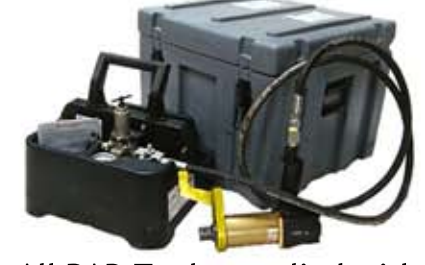
All RAD Tools supplied with Cradle, Hose & Case